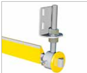
8150 HM scraper board + square tube 8127.