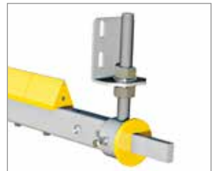
9750 Flexus 2. adapter 9777 is also needed.