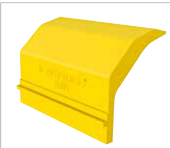
Rasmus blade in detail. Full length spare part 8342 is 2.1 - 2.2m.

Recommended for \varnothing 220-400 mm pulleys.